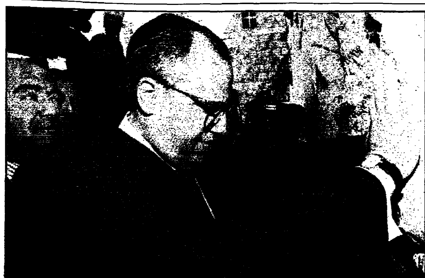
Colombian President Ernesto Samper visits the Western Wall yesterday.